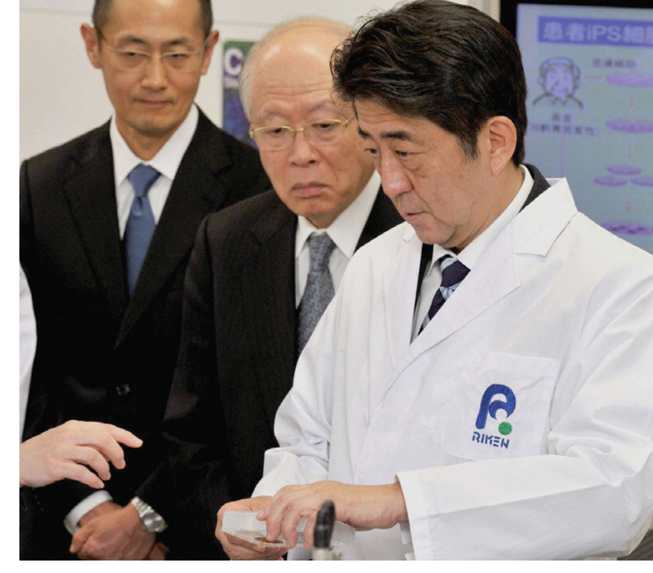
Shinzo Abe: Implementation is now key for his government's health reforms

Recent discussions within the LDP to scale back tax deductions for corporate R&D spending appear to contradict the Abe Administration's focus on innovation. The move is being mooted as a way to