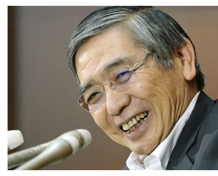
All smiles now? Bank of Japan Governor Haruhiko Kuroda

Shiozaki also takes responsibility for highly contentious but crucial labor market reforms, including proposals >>>